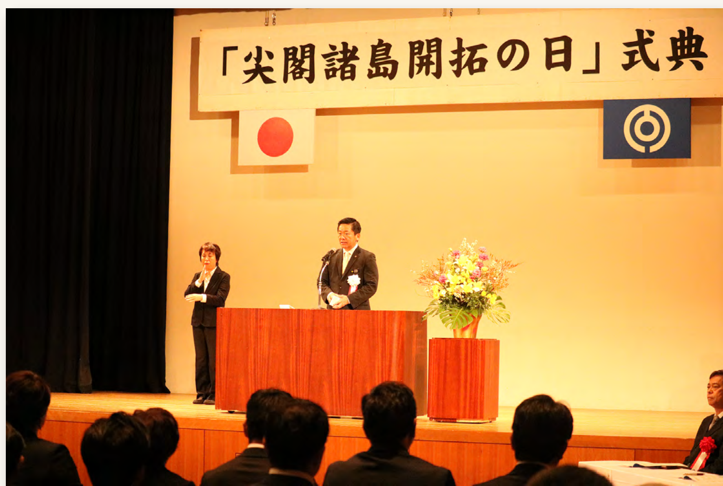
“Senkaku Islands Day” Ceremony (2018)