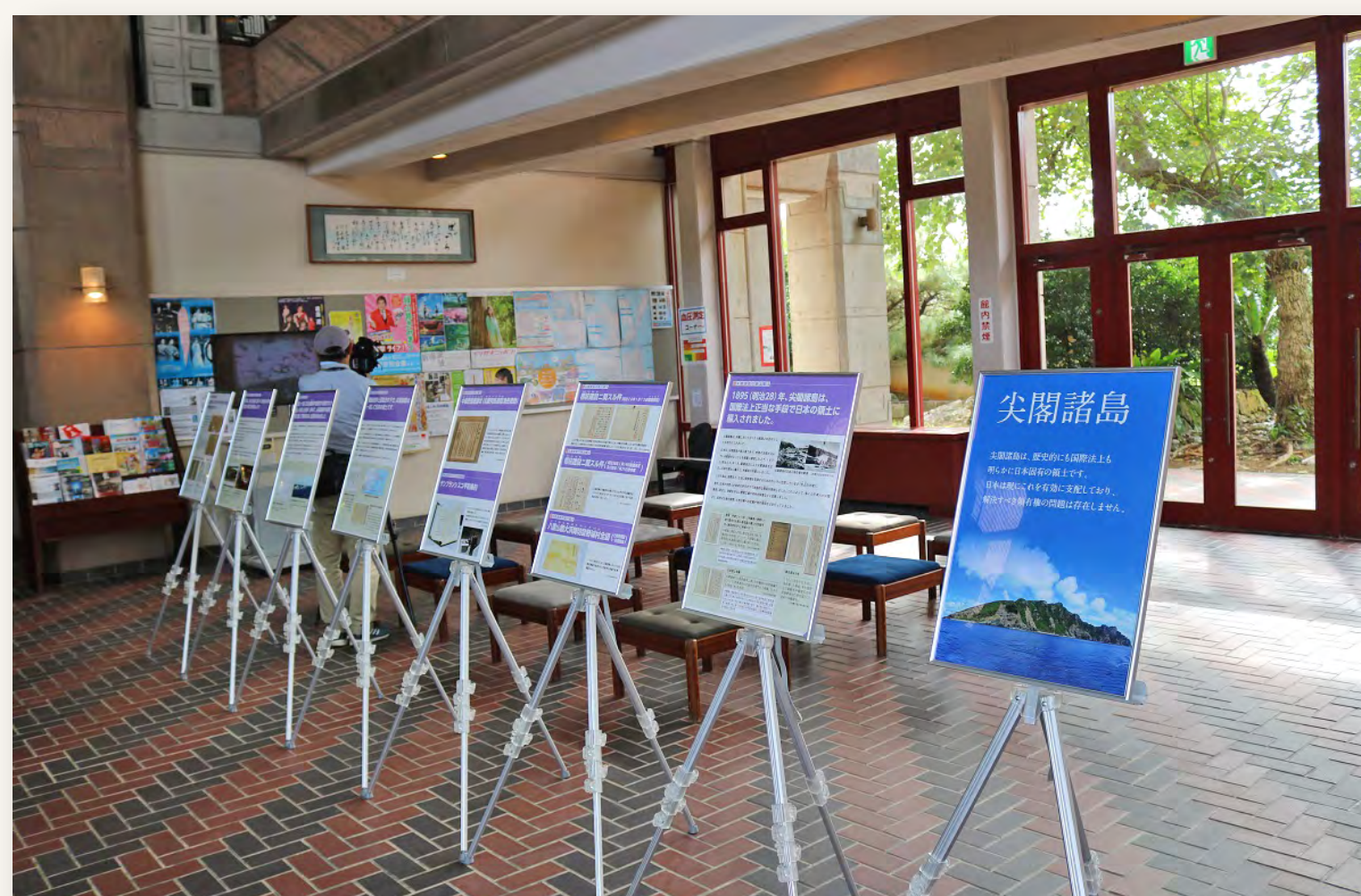
Panel display at a venue (with the cooperation of the National Museum of Territory and Sovereignty) (2019)